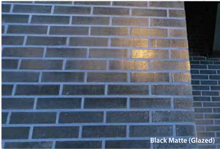
Black Matte (Glazed)