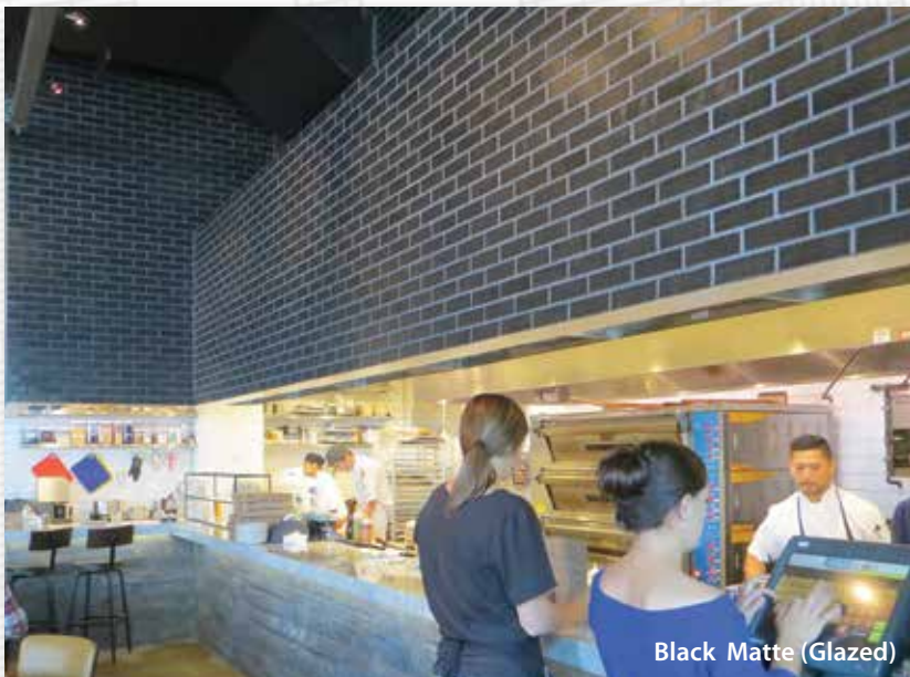
Black Matte (Glazed)